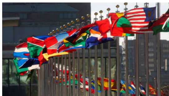
Ilustracja 1: Siedziba ONZ, New York

I was in the first class in high school when I told my mother, "I want to learn Spanish". I remember that I had been very stressed before my Spanish teacher came. I bought a book she told me about and we started next week. I was doing my best and after less than a year I could speak quite well .