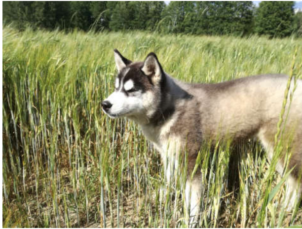
King of the world

But when he doesn't eat something that's junk food, we have to remember to feed him high protein meals. The easiest way is to give him a couple of fresh bones (about 3 during a week).