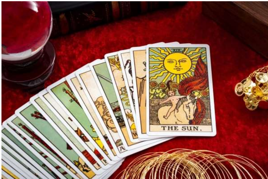
“The picture shows a few tarot cards”