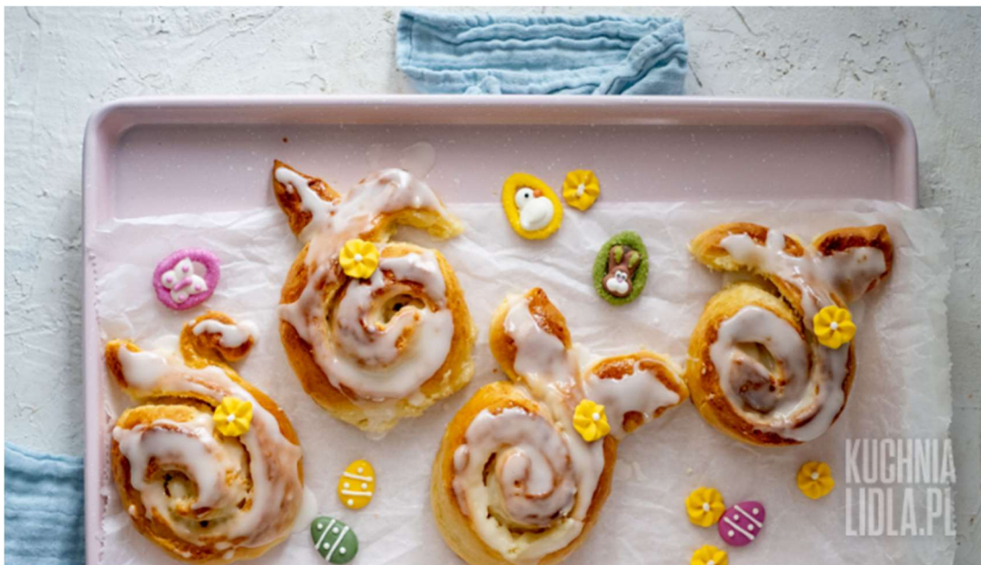
The picture shows cheesecake bunnies.