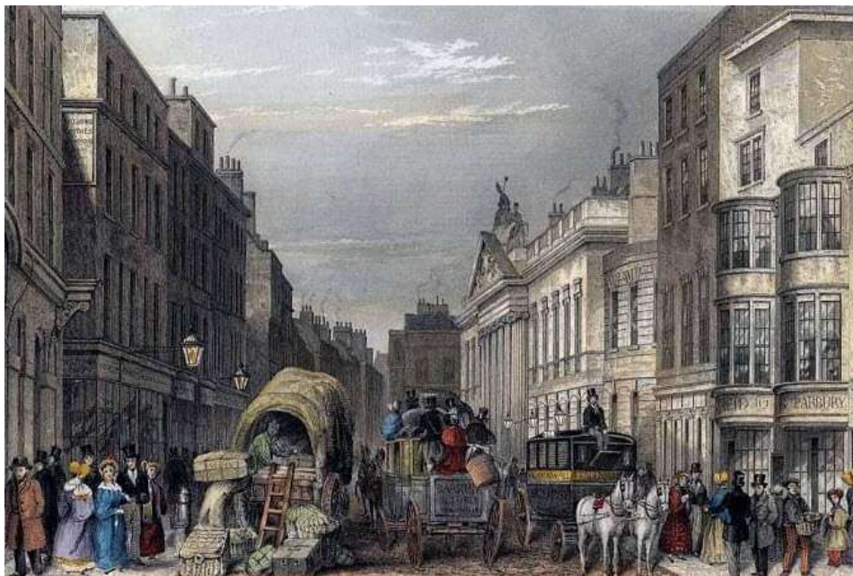
The picture depicts 19th-century London that is dirty, crowded and polluted.

Have you ever thought about 19th century London? Many English-language authors depicted the city in their works. They often showed the real side of London - ugly, dirty and dark. For instance, Charles Dickens set his novel 'Great Expectations' in London.