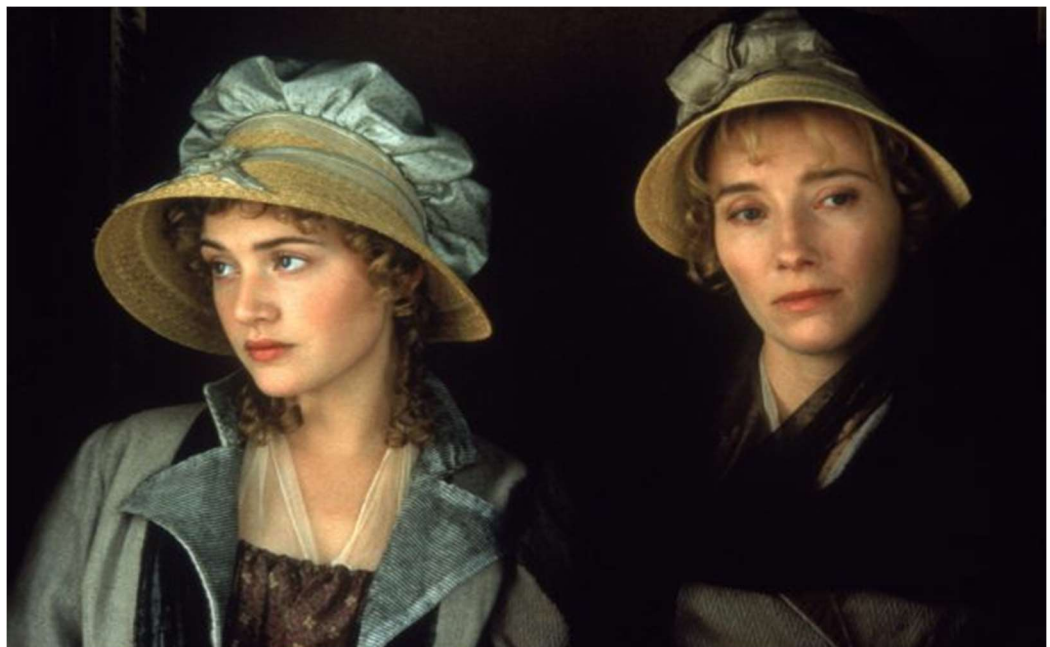
The picture shows Elinor and Marianne Dashwood wearing an old-fashioned dress and hat.

In conclusion, as much as we can, we have to agree that Jane Austin has used her real-life experiences to make her work worth spending every minute reading.