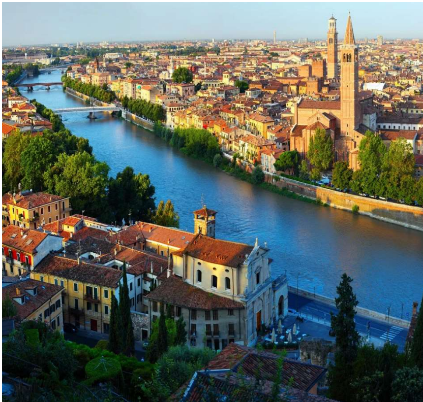
The picture shows the town of Verona, where Romeo and Juliet secretly met.

In conclusion, 'Romeo and Juliet' is recognised as one of the most iconic books of all time due to its unique atmosphere. We totally recommend this book and hope as many of you as possible will read this classic!