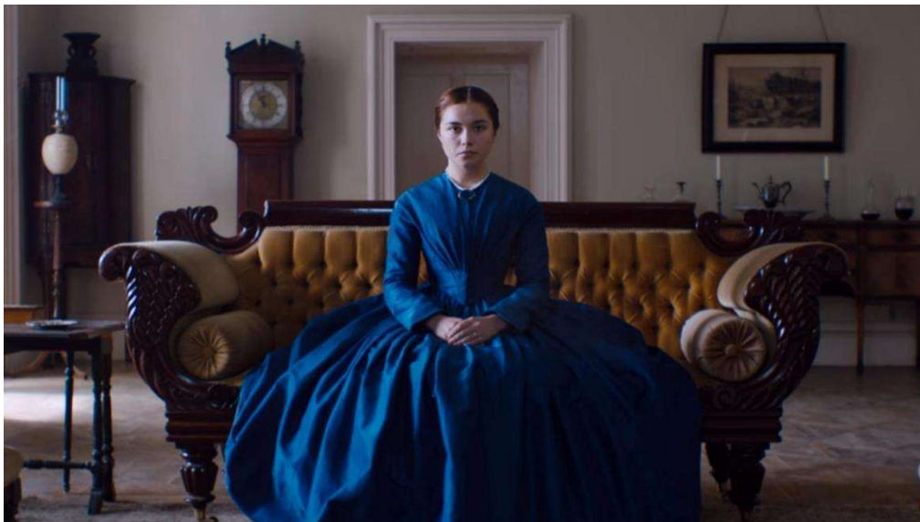
The picture depicts Lady Macbeth dressed in a beautiful long turquoise gown. She is sitting on a brown stylish sofa in an elegant drawing room.

We can tell that Macbeth's tale is the story of a man who, influenced by his innermost dark desires, descends into madness. It is a warning to us all - we should never let our ambition blind our conscience and lead us down the path of darkness.