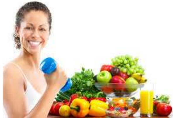
The photo shows an athletic young woman and a large amount of fruit and vegetables.

The definition of the word lifestyle refers to a way of life that reflects the attitudes and values of a person or group. When you start to see health and fitness as a lifestyle, you develop behaviour that will improve many areas of your life. As I mentioned earlier, health and fitness is not just about diet and exercise. It is a way of life. So why should we not change our bad habits?