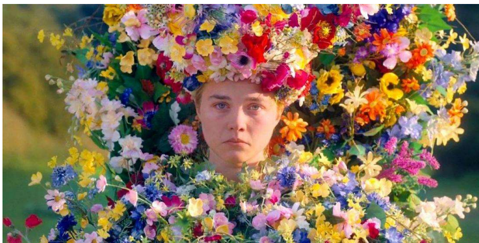
The picture shows a young woman dressed in a flower gown with a flower crown. She is sad and looking directly at the viewer.

„Midsommar” is a must-see for all fans of modern horror. The camera work and the level of hidden details are incredible. Overall the movie is ambitious and above all unsettling, which is perfect for horror freaks like me.