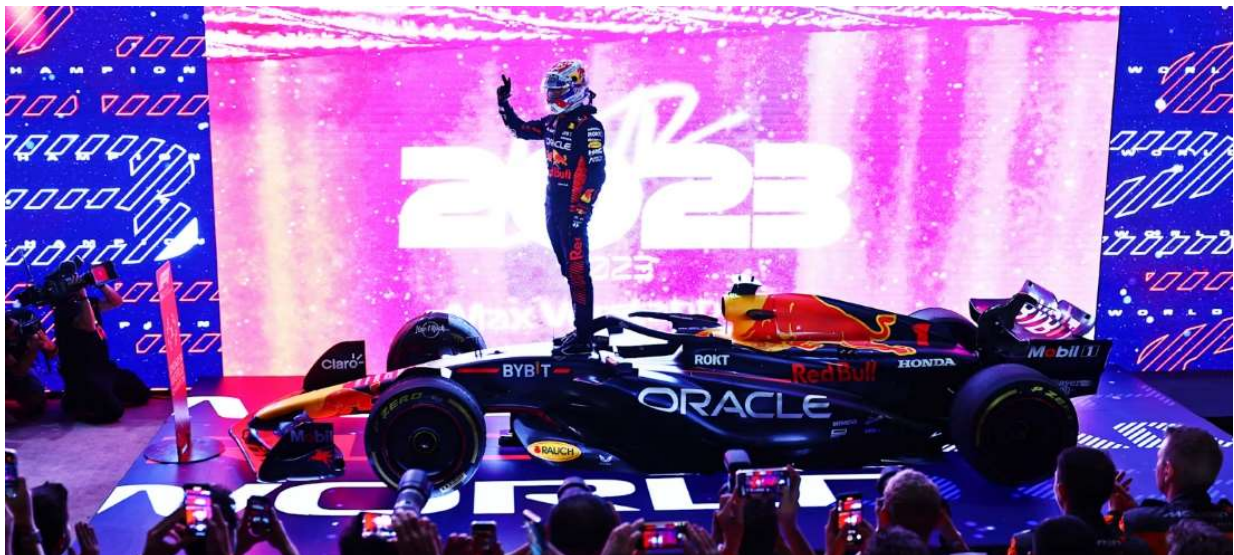
The photo shows Max Verstappen after winning the third world title

Max Verstappen clinched the championship title in Saturday's sprint race, securing a second-place finish. Verstappen's achievement makes him the first driver to accomplish this feat in a sprint race, marking a notable milestone in only the third season of this innovation in F1.