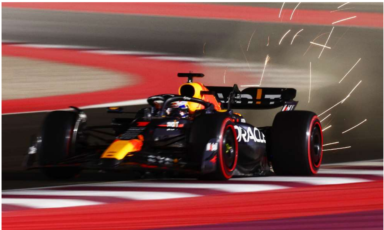
The photo shows Red Bull's car for 2023, which is called the RB19

Without a doubt, Verstappen is one of the best drivers ever. Through constant self-improvement, he has reached a level of near-perfection, which he demonstrates time after time in races. This season, he has undoubtedly been supported by the excellent Red Bull car.